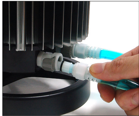
Figure 3: coupling of cooling tubes to the reserator