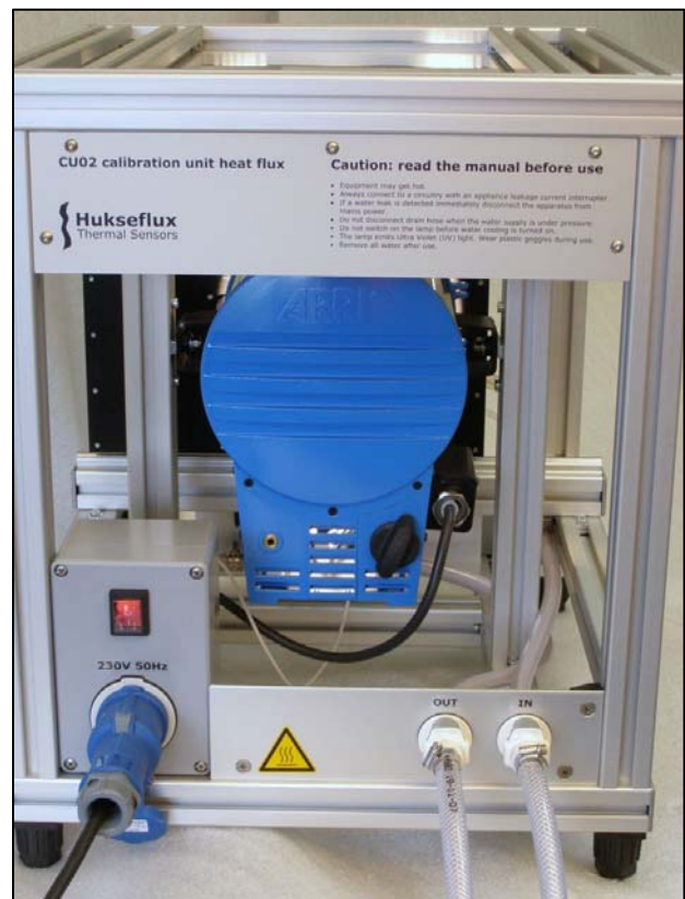
Figure 4: Picture of calibration unit CU02, showing water supply (in / out), power supply and heat source (1250 Watt lamp, housing in blue). At the background the water-cooled plate on which the sensors are mounted, is visible.

The picture shows CU02 calibration unit for heat flux sensors.